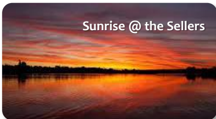
Sunrise @ the Sellers

On the night he was arrested, Jesus asked his disciples to keep watch with him in the Garden of Gethsemane prior to his arrest. This Maundy Thursday, after our Holy Week worship service, we will light a bonfire by the roadside from 7 pm to 7 am as a place for reflection. We invite you to stop by sometime during the vigil for a time in prayer.