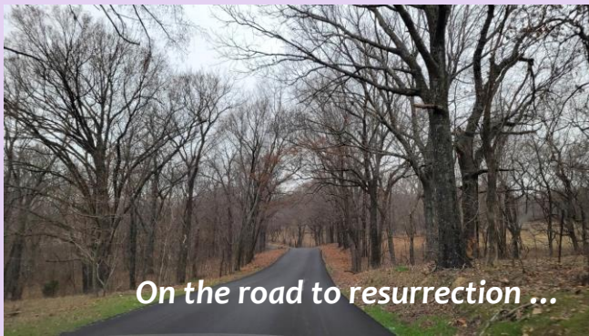
On the road to resurrection ...

One of the joys of the Christian walk is sharing life with others. You're invited to text or email the pastors photos of places and descriptions of meaningful experiences you encounter along the way on your Lenten journey. A video will be created each week using these pictures and narratives. It will be shared in worship on Sunday as we make our way to the empty tomb.