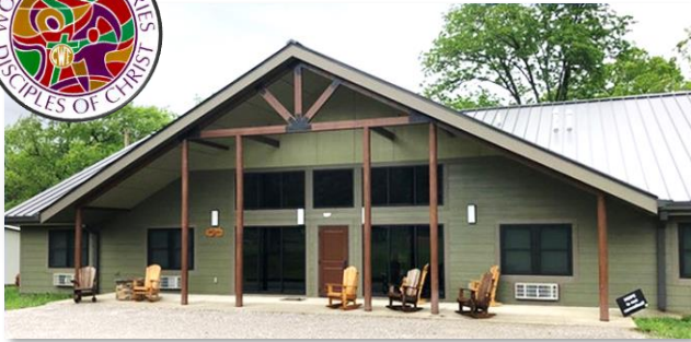
The new Gibson Lodge awaits the return of the DW Retreat!